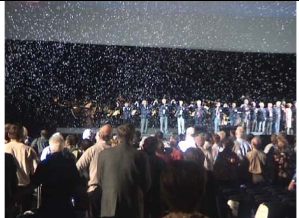
A Rousing Finale Auld Lang Sine!