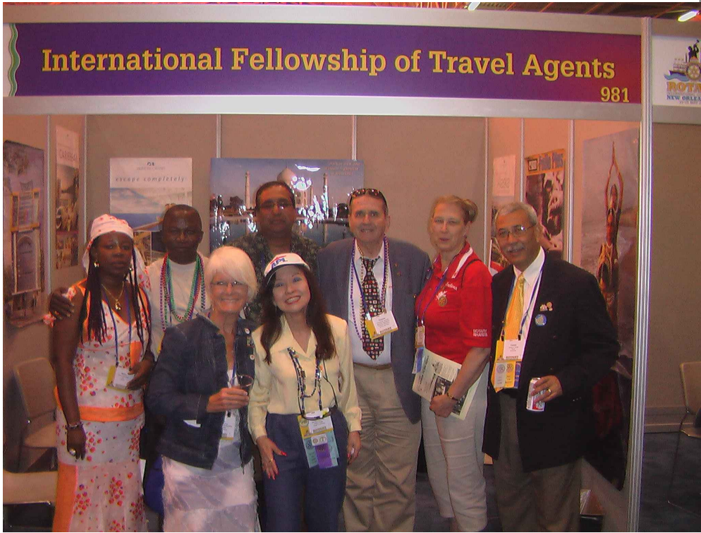
IFTA Party at Booth 981 On May 25, 2011